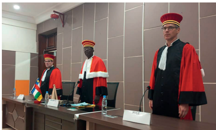
Judges of the Appeals Chamber of the Special Criminal Court of the Central African Republic, February 15, 2023

spread across the entire chain, including logistics, prisons, and training for the police (and not just the judiciary).