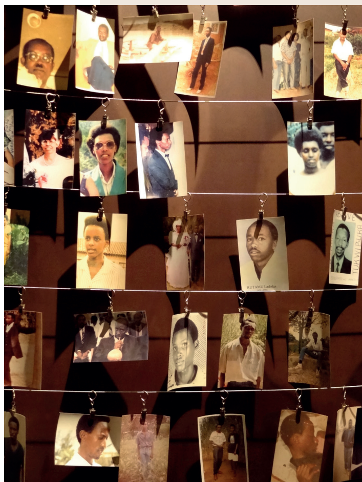
Photographs of victims of the Tutsi genocide, Kigali Genocide Memorial, Rwanda, April–July 1994

EU states are represented in the network by national contact points (prosecutors, investigators, mutual legal assistance officers, etc.). The Genocide Network Secretariat was created in 2011 and is hosted by Eurojust. The network brings its members together twice a year to coordinate ongoing work on the investigation and prosecution of perpetrators of the most serious international crimes.