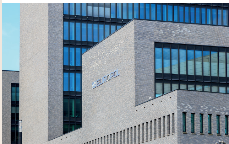
Europol buildings, The Hague, Netherlands

Pooling also avoids the multiplication of respondents, the risk of confusion, and the risk of trauma caused by over-solicitation of victims. For example, when dealing with Ukrainian refugees in France, a coordinated circuit (the DACG, public prosecutor’s offices, the OCLCH, the PNAT) was rapidly established for collecting information from victims present on French territory. The database that was set up as a result may also be useful in France’s collaboration with Ukraine and the ICC. This work of collection could be started upstream and extended via Frontex and Europol. The mobilization around the Ukrainian situation and the experience gathered there offers great potential for innovation and reorganization, and ought to be put to good use in future situations.