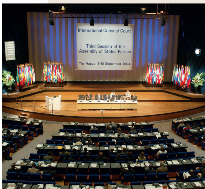
Third session of the Assembly of States Parties to the Rome Statute of the International Criminal Court, The Hague, Netherlands, September 2004

Part IX of the Rome Statute, articles 86 to 102, is devoted to international cooperation and judicial assistance. The principle of complementarity, meanwhile, is affirmed in the Preamble to the Statute and is reflected in several articles of Part II on jurisdiction, admissibility, and applicable law, and in Part IX.