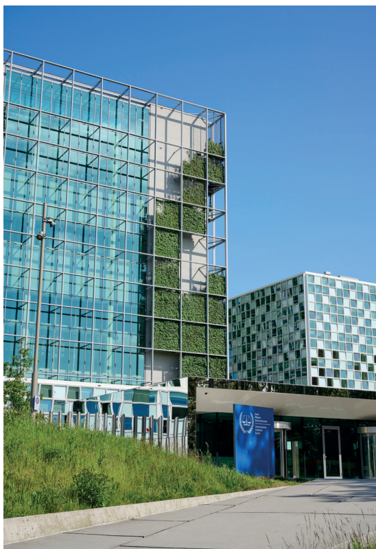
Headquarters of the International Criminal Court, The Hague, Netherlands

Numerous questions also arise in relation to the ICC prosecutor's choice to join the joint structural investigation opened on March 25, 2022, under the aegis of Eurojust, by Ukraine, Poland, and Lithuania. In a public statement, Prosecutor Karim Khan argued that "this kind of partnership shows that it is possible to change the dynamics of judicial cooperation—not only in Ukraine, but everywhere else. National judiciaries have significant capabilities and can enable cheaper and more efficient proceedings. Instead of The Hague being the basis for international criminal justice, we can create a common front of national investigators and prosecutors, national courts, and the ICC, while preserving the independence of each of these institutions" ( Le Monde , May 14, 2022 ; and Artsakh.news , May 15, 2022).