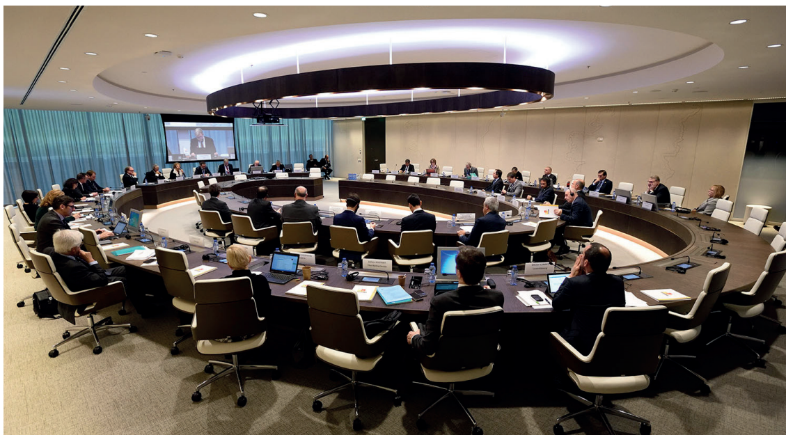
Eurojust Agency meeting room, The Hague, Netherlands.