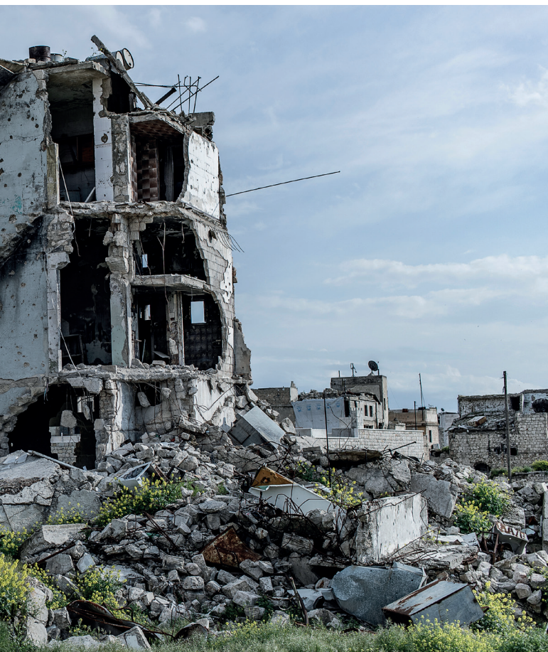
Destroyed building, Aleppo, Syria, 2019

with a more general mandate? A report on this question, including various options, was presented at the G7 summit in June 2022, paving the way for this type of solution. 22