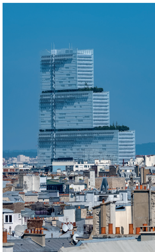
The Paris Courthouse

When this framework includes a certain number of reservations and conditions, as is the case in French law, jurisdiction is not absolute. In such cases, it is sometimes described as “quasi-universal.”